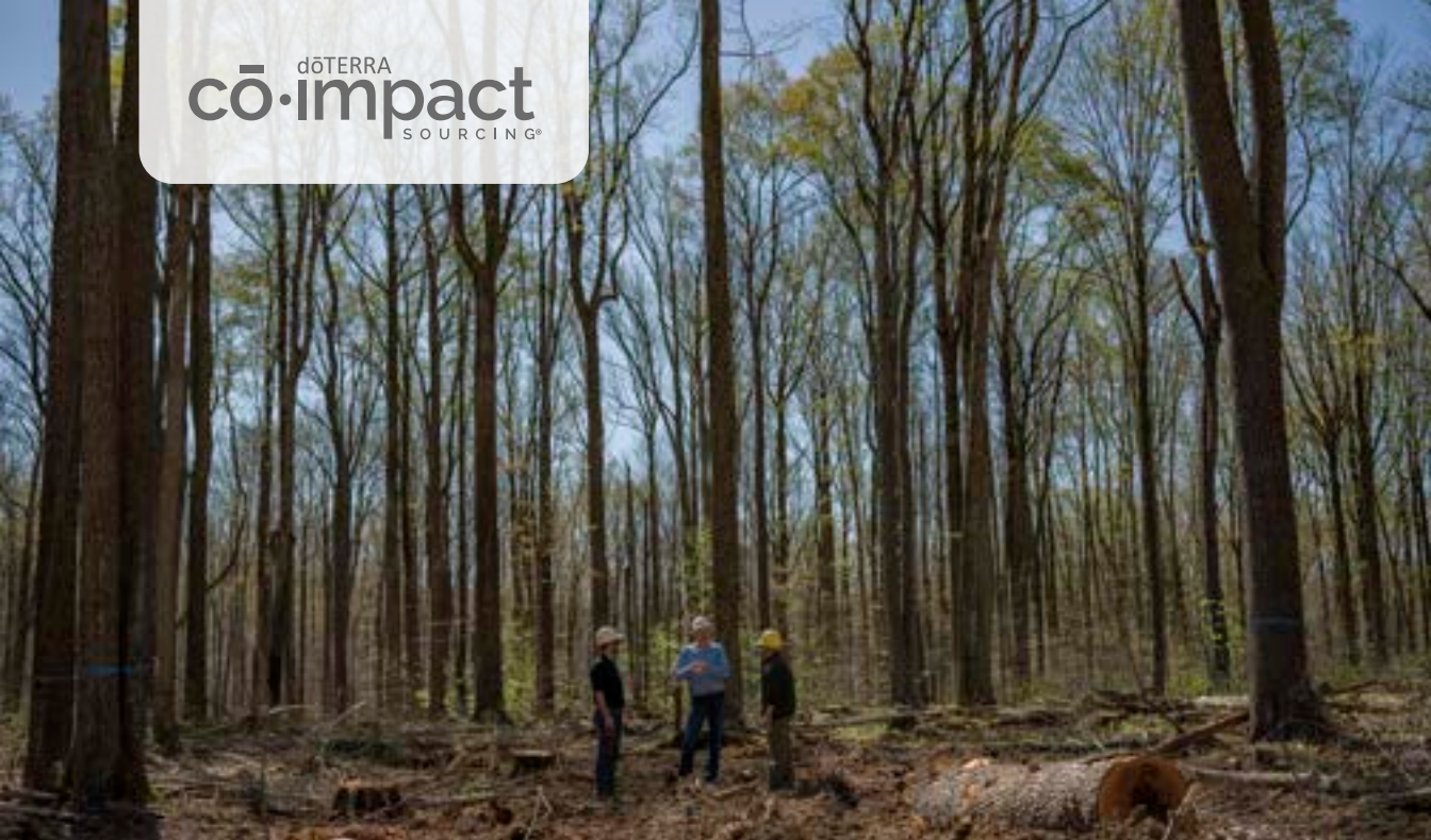
Forest in Pennsylvania where birch trees grow abundantly.

Birch essential oil has been used traditionally for many generations, typically only available in small volumes due to the complexity of raw material preparation and distillation. Over a decade ago, dōTERRA sourced a small supply of Birch essential oil from the Northeastern United States. Eventually, dōTERRA outgrew this supplier's production, and Birch oil, temporarily, became a thing of the past. That's when dōTERRA began the pursuit to produce our own Birch oil in sufficient volumes, meeting stringent CPTC® standards.